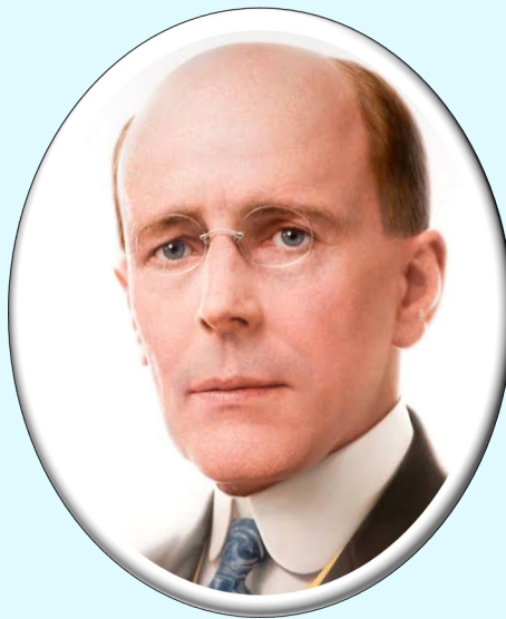
Paul P. Harris Founder of Rotary 19th April 1868 - 27th January 1947

ROTARY CLUB OF BERHAMPUR EAST R.I. DIST. 3262 Dharma Nagar, 5th Lane, Berhampur -2, Odisha